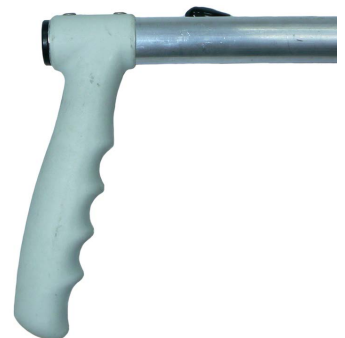
PVC handle on both models