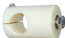
Alternate mounting: NSM-218