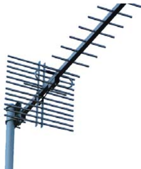
Y415 fitted with YFRS-AL Flat Rear Screen