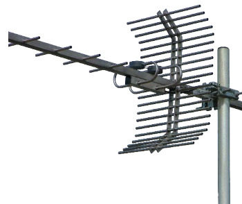
Y615TVSS fitted with YVRS-SS Vee-shaped Rear Screen