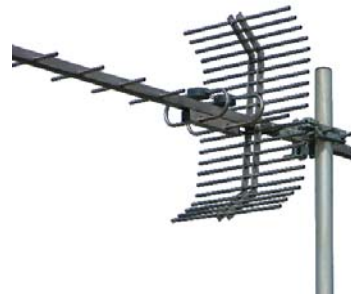
Y615TVSS fitted with YVRS-SS Vee-shaped Rear Screen