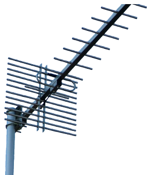
Y415 fitted with YFRS-AL Flat Rear Screen