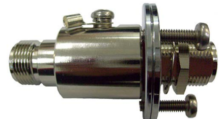
FLA-1792 flange mount