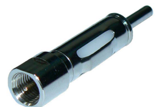
FME male to AM/FM radio adaptor supplied for plug & play installation