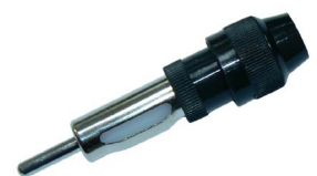
Solderless car radio connector supplied, not fitted