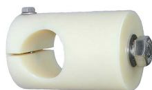
Alternate mounting: NSM-218