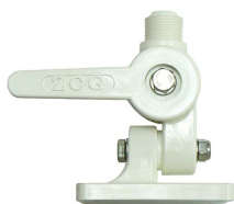
MM1 fold-down base