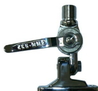
MM2 fold-down base