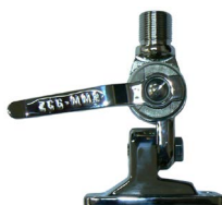
MM2 fold-down base