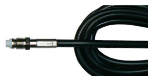
FME female for magnetic base termination