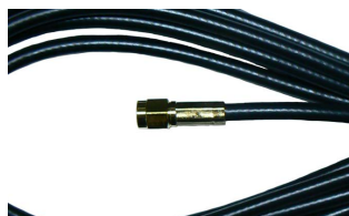
SMA male termination