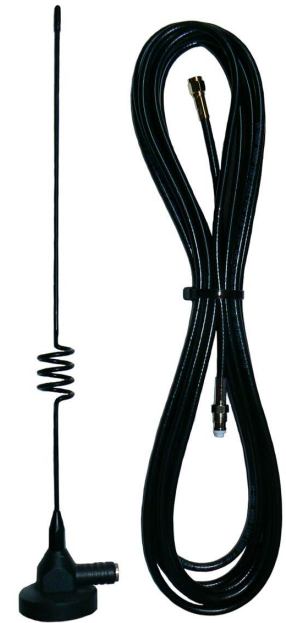
MAG-M90T800 or MAG-M70T700