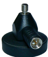
Magnetic base with FME male termination and M6 thread