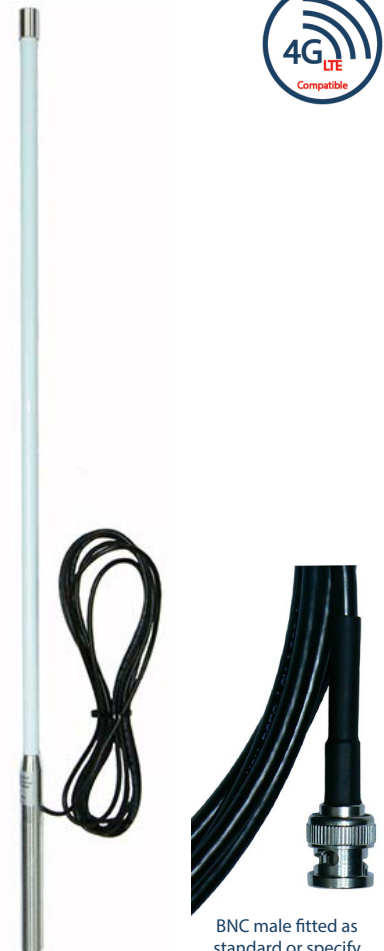
BNC male fitted as standard or specify requirements