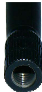
M6 x 1.0mm female thread in mount ferrule