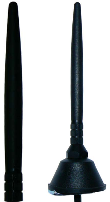
M80T whip fitted onto XB-4.7 cable base - will require metallic ground plane for effective performance